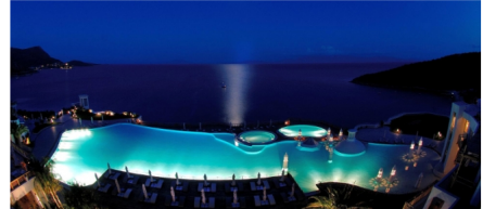
The Kempinski Barbaros Bay is a picturesque setting for an active family holiday.