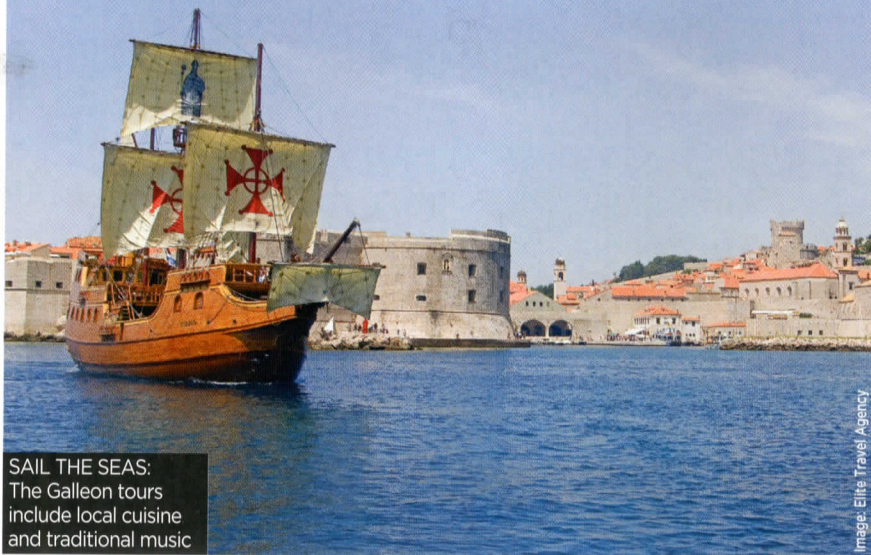
SAIL THE SEAS: The Galleon tours include local cuisine and traditional music