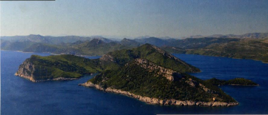
ISLAND HOPPING: Visit the Elafiti Islands of Kolcep, Lopud and Sipan