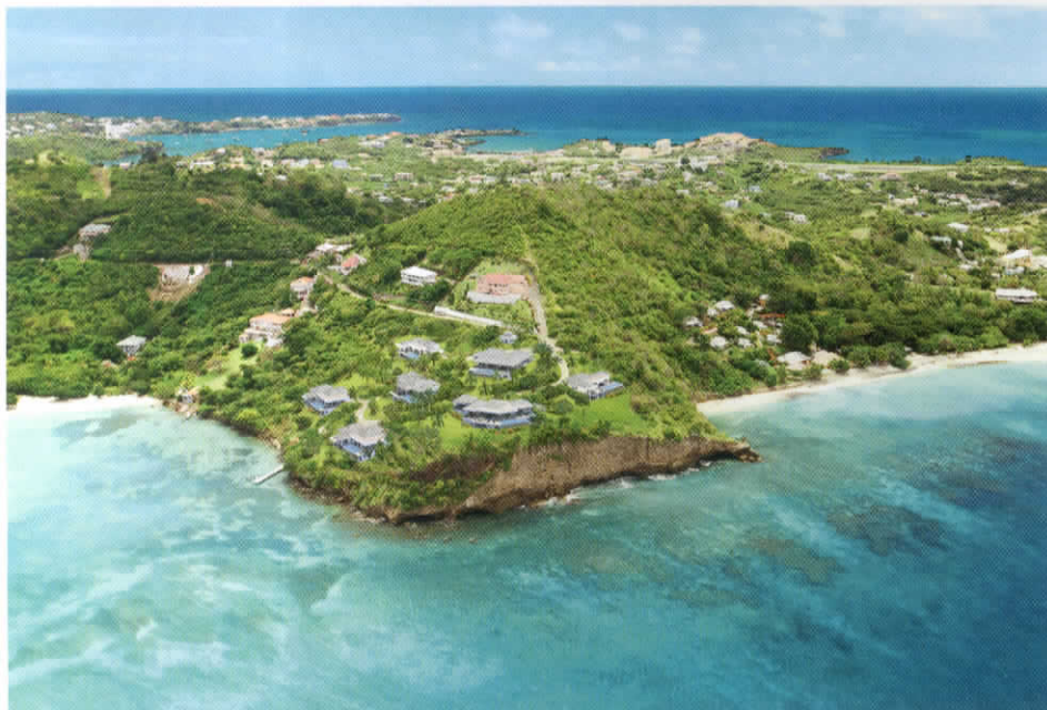
On the waterfront: the 25-acre villa development at Laluna Estate adjoins the world-famous Laluna hotel on Grenada