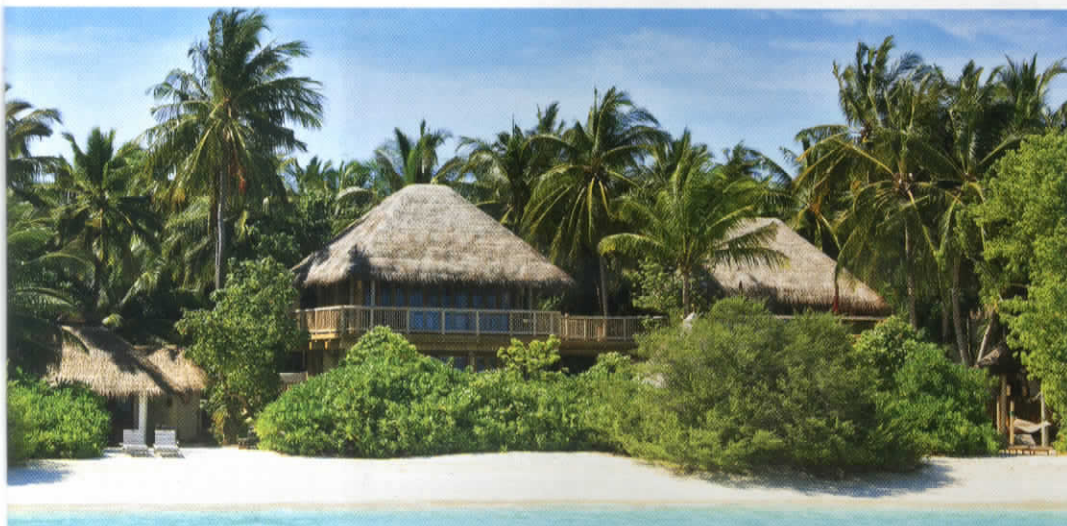
Soneva Fushi's beachfront villas offer the ultimate in barefoot luxury and privacy—there are only 65 villas on the one-mile-long island, so this is a rare opportunity

LOFT Niseko is sited on Hokkaido island and is a luxury development of loft-style apartments. Price on application. Yoo (020-7009 0100; www.yoo.com )