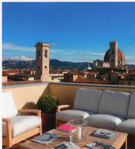
Palazzo Tornabuoni has apartments in a 15th-century palazzo in Florence, Italy

The Ritz-Carlton Residences feature luxury apartments in upmarket Palm Beach. From £475,000. Knight Frank (020-7629 8171; www.knightfrank.co.uk )