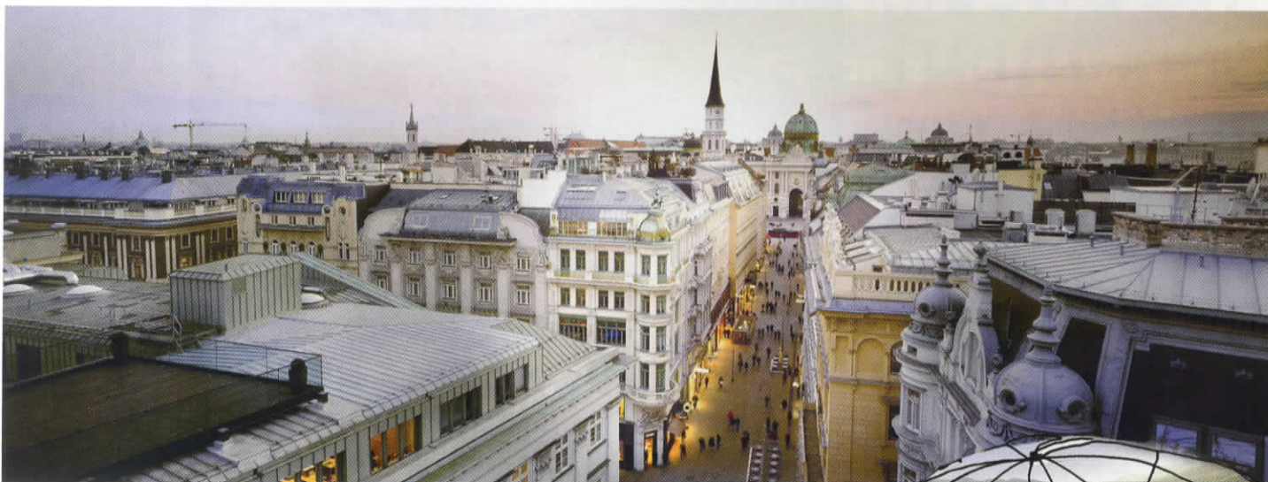
A bird's-eye view from the luxury penthouses of Goldenes Quartier in Vienna, Austria