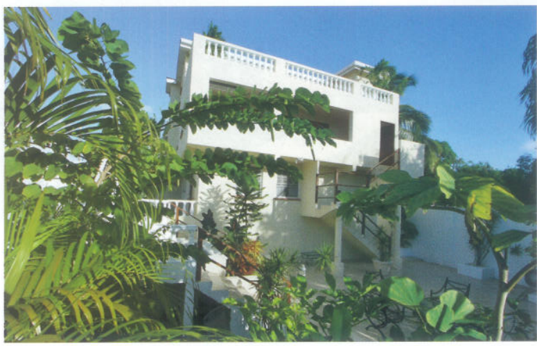
↑ Barbados, Holder's Hill $725,000

Holly Kirkwood tours the world to find the best second homes for sale at $500,000 or less