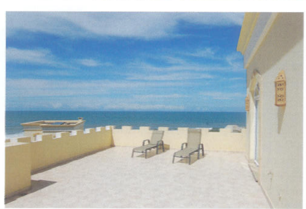
↑ Morocco, Aglou Plage €475,000

Rebuilt by the current owners in 1995, this three-bedroom villa is set among pine trees on the Ria Formosa Nature Reserve, near Tavira. It affords views over its own grounds, the surrounding farmland and the distant hills beyond. Winkworth (020–7691 4269; www.winkworth.co.uk)