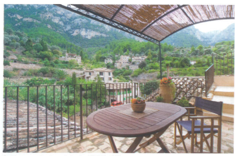
← France, Indre-et-Loire €549,500

This spacious apartment in Deía has three bedrooms, high ceilings and many original features, plus a friendly eat-in kitchen with built-in seating area. The feeling of space is further enhanced by the two large terraces; one in particular enjoys far-reaching views of the entire village and out over the mountains. Available through Knight Frank (020–7629 8171; www.knightfrank.co.uk)