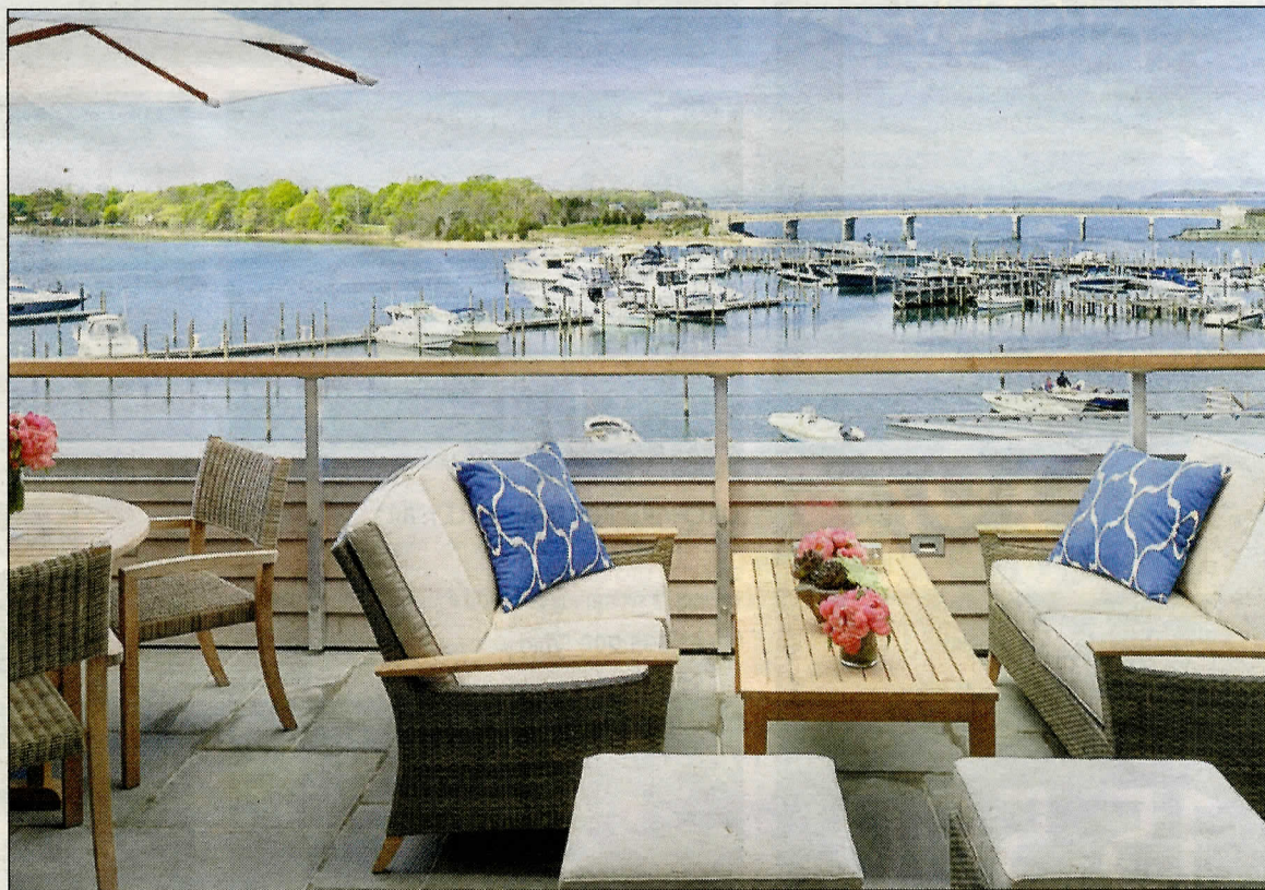
From £1,572,000: two- and three-bedroom flats at Sag Harbor in The Hamptons, US, offer a peaceful retreat and rooftop pool