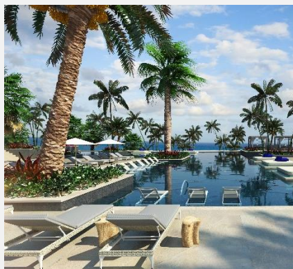
UNICO 20°87° Hotel Riviera Maya