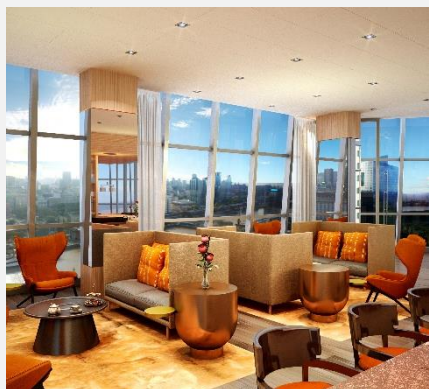
Alvear Icon Hotel & Residences

An uncommon experience not to miss: Located in Tanzania's Shungimbili Island Marine Reserve, marine conservation is at the core of the Island's offering. Through ongoing partnerships with the Tanzanian Marine Parks and the leading NGO, Sea Sense, guests are encouraged to get involved in a range of educational projects, such as marine wildlife monitoring or awareness workshops with villagers on neighboring Mafia Island.