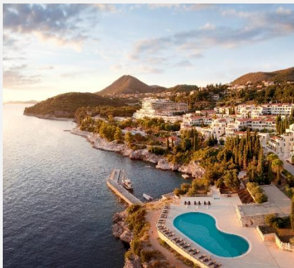
Sun Gardens Dubrovnik