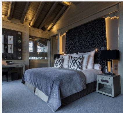
Le K2 Altitude