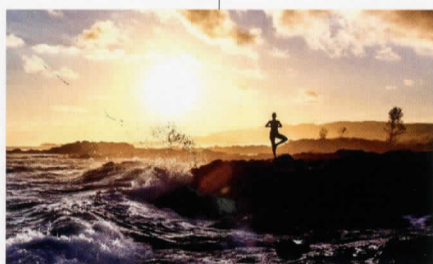
SHANTI MAURICE Rivière des Galets, Mauritius