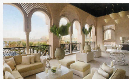
ESPA ONE&ONLY THE PALM Dubai, UAE

Forget everything you know about the Maldives. Tom McLoughlin, the GM and one of the brains behind this new project, thinks way outside the box (he brought us the world's first underwater spa). So Amilla Fushi's contemporary ocean villas stand proud above the coral reef and the spectacular two-bedroom treehouses rise up above the lush canopy. Plus every guest gets a free 50-minute spa treatment EVERY DAY, in the timber-clad private spa pods amidst the trees or in the buzzy main lounge/nail bar/beauty salon. There are top-to-toe daily specials (classics like full-body scrubs and facials), plus clever add-ons you pay for – an extra 15 minutes on your shoulders, say – and longer rituals for diehard spa-goers. All are performed by tip-top therapists using the best in the biz: QMS Medicosmetics facials, ILA body treatments and Margaret Dabbs manis and pedis. There are even Gentlemen's Tonic wet shaves, and top of the pops are the massages, courtesy of London's Pure Massage. Last but not least, kids are kept happy, happy, happy with unlimited watersports. Everything except scuba diving is on the house, so you won't see them for sea spray. Clever, very clever.