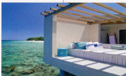
AMILLA FUSHI Baa Atoll, Maldives