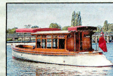
CLASSY: The Genevieve riverboat

ENJOY a day cruising along the Thames aboard Edwardian riverboat Genevieve. To celebrate her 100th birthday, private charters have been discounted by £100 in June and July. A fully crewed trip costs from £600 for up to ten people. Visit vintage-thamescharters.com .