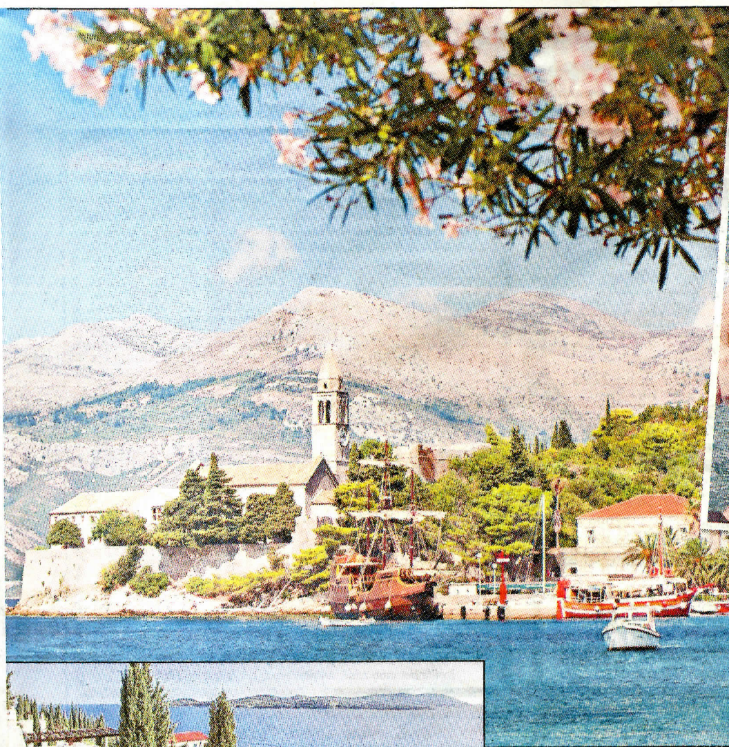
BOY RACERS: Dan and nephew Cameron aboard their jet-ski. Left: The island of Lupud

SAVE up to £500 on a six-night Burgundy river cruise departing July 19. The Caprice, a luxury hotel-barge, will visit vineyards and historic towns and you can enjoy fine wines and gourmet meals while on board. The trip costs from £1,395pp on an all-inclusive basis with return rail travel and excursions. Visit planetrail.co.uk .