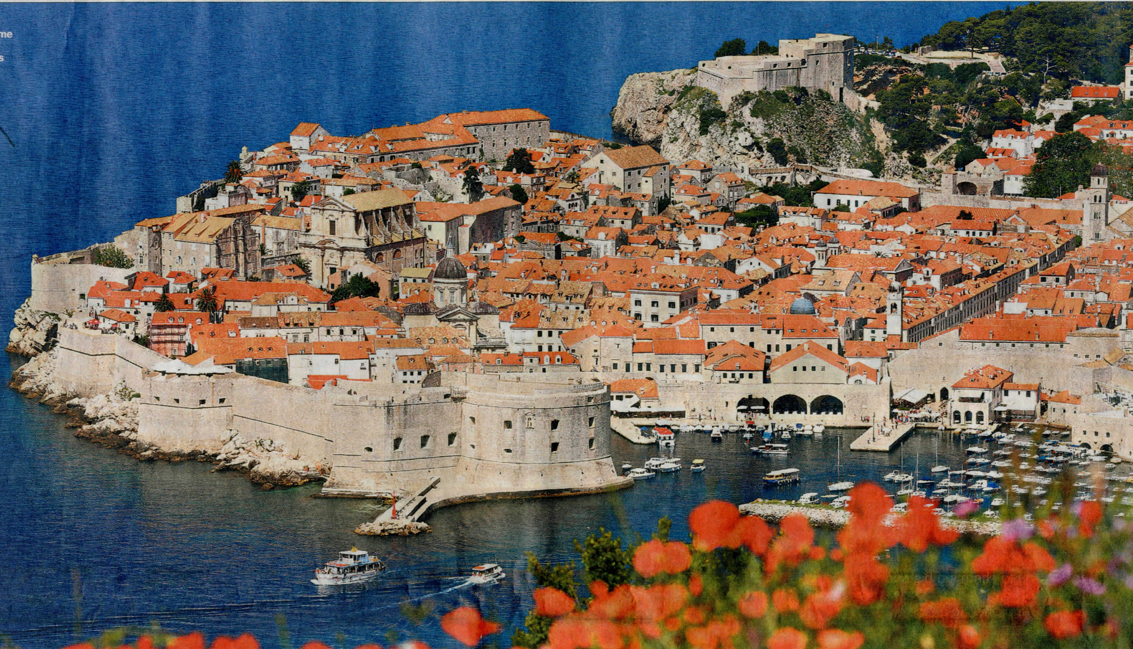
Dubrovnik's old town, where a 'Game of Thrones' tour is among the options

Including the five best: beaches, villas, cultural tours, activity breaks, and wine and food excursions