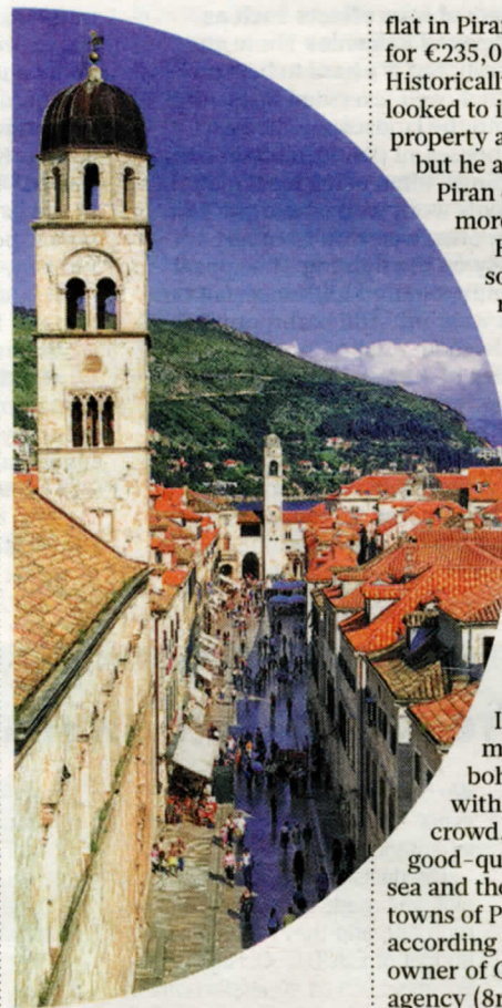
101 reasons to buy Dalmatian highlights include the old town of Dubrovnik, above, and unspoilt islands such as Sipan, right