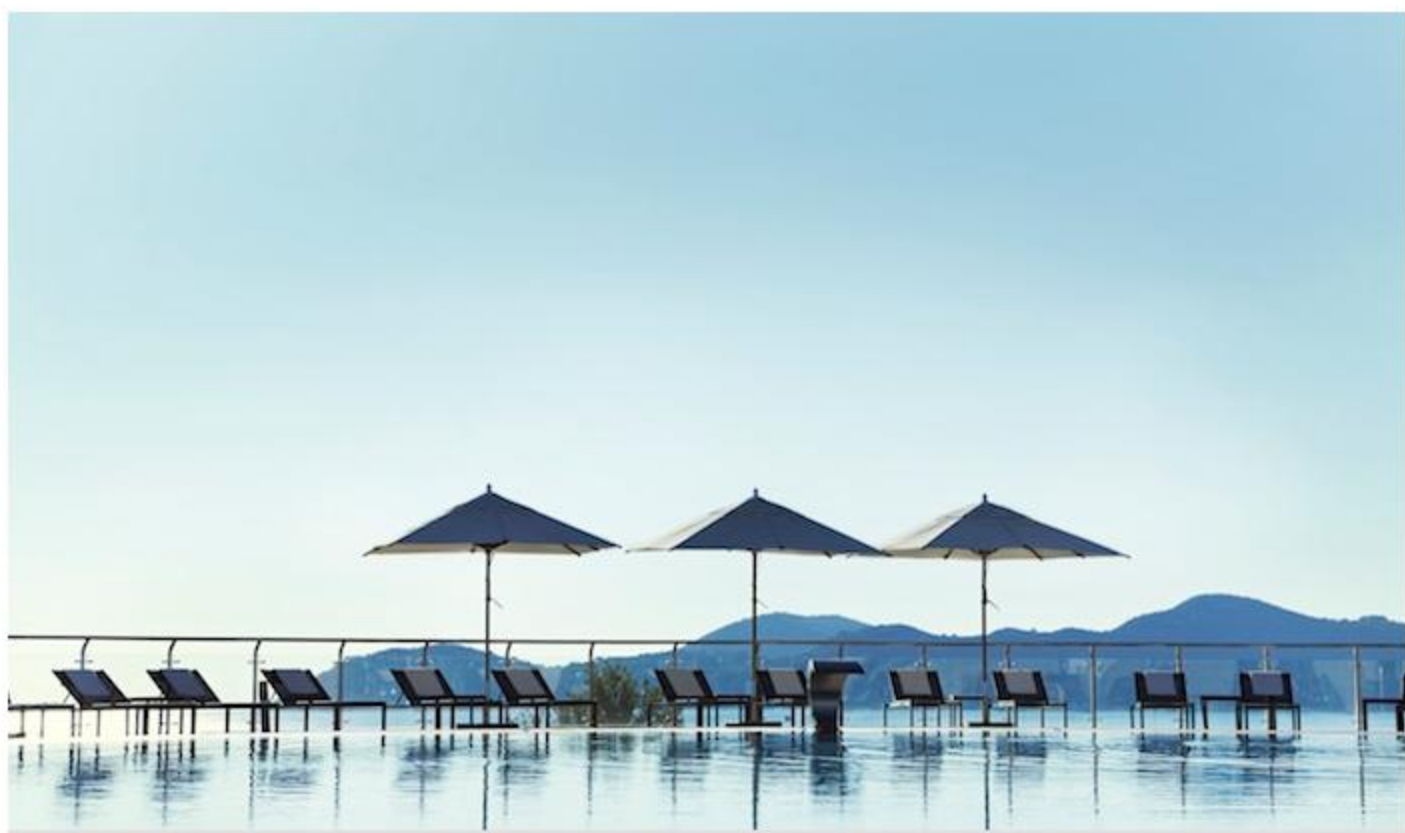
The pool at sunset, Radisson Blu Sun Gardens, Dubrovnik

Eat at The Market for fish platters fit for a King.